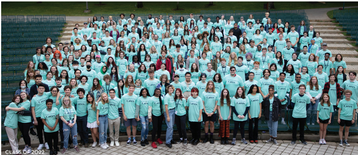
CLASS OF 2022