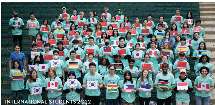
INTERNATIONAL STUDENTS 2022